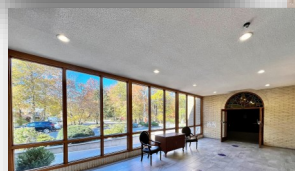
Lobby/Cocktail Lounge Area