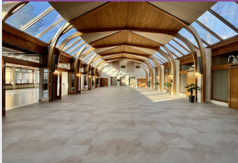
Atrium (Mekhjian) Hall